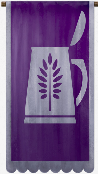
THE HOSPITALITY COLLABORATIVE, BREWERS GUILD