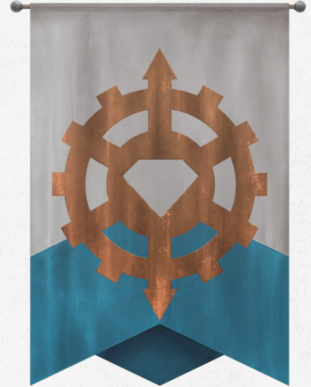
THE FILIGREED UNION, TINKERS GUILD

system of checks and balances, which has kept the guild profitable and in good standing with the public. In fact, the only gripe most denizens have is the large amount of foundry smoke that can sometimes become trapped under cloud cover. Foundries and forges that have been incorporated into the Guild display a silver marker on their door that has been stamped with the Guild's symbol.