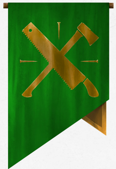
THE LUMBER COMPANY, CARPENTERS GUILD