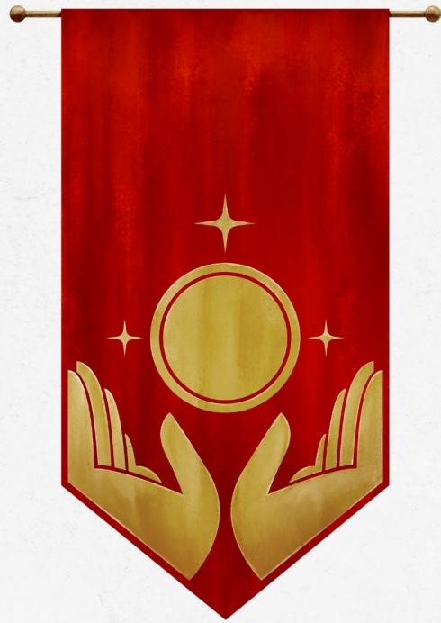
THE MERCANTILE GUILD

Although referred to as a guild, this political and economic faction actually governs the people and other guilds of Antronec. From the Administrative Capitol Building in the Gilded Quarter, the Guildmasters direct and supervise the city's affairs. Guildmaster Chantelle Redcliff, a female human, and her spouse Thrift Redcliff, a female tiefling, maintain Antronec's public services, draft legislation, monitor the economy, and meet with ambassadors to discuss foreign affairs. They also coordinate the city's judges, recordkeeping, banks and mint. Career politicians, they direct public opinion and mediate guild tensions with their charm and cunning. Indeed, most members of this guild are skilled