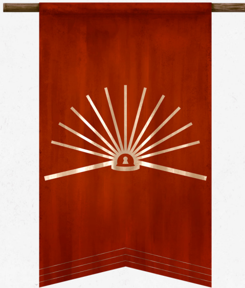
THE BOOK BINDERS, LIBRARIANS GUILD