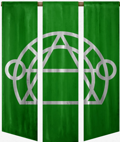
ALCHEMICAL FEDERATION, ALCHEMISTS GUILD