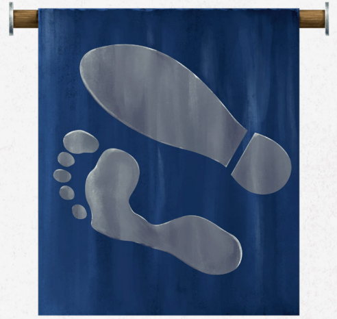
UNIFIED COBBLECRAFT, COBBLERS GUILD

Enemies. Though usually not violent in nature, the guild does have occasional bidding wars and competition with the Order of Hues to obtain the finest inks for their maps and charts.