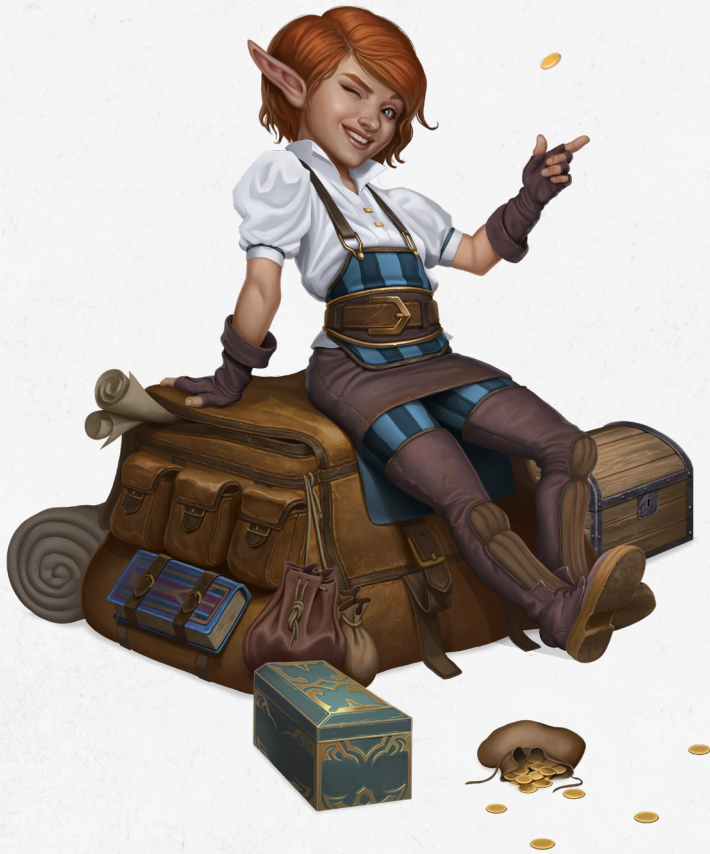
COLLEGE OF MERCANTILE