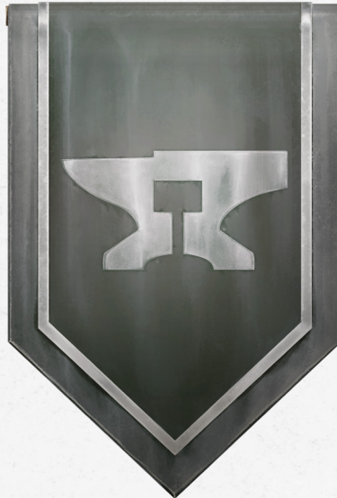
METALLURGY INCORPORATED, SMITHS GUILD