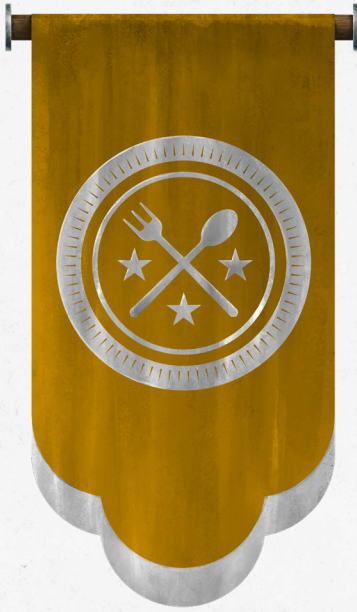
THE TASTEMAKER SOCIETY, CHEFS GUILD