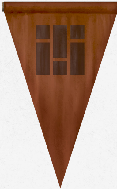
THE LEAGUE OF BRICKS AND MORTAR, MASONS GUILD