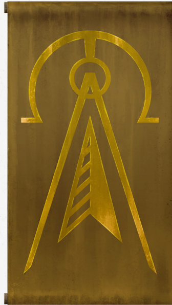
THE CARTOGRAPHER'S GUILD