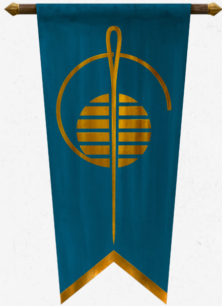
THE TEXTILE COLLECTIVE, TEXTILE GUILD