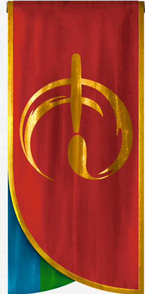
ORDER OF HUES, PAINTERS GUILD

favor unless they commit to joining or formally contracting with a specific guild of their choice. This comes with various dangers, but can also provide great benefits.