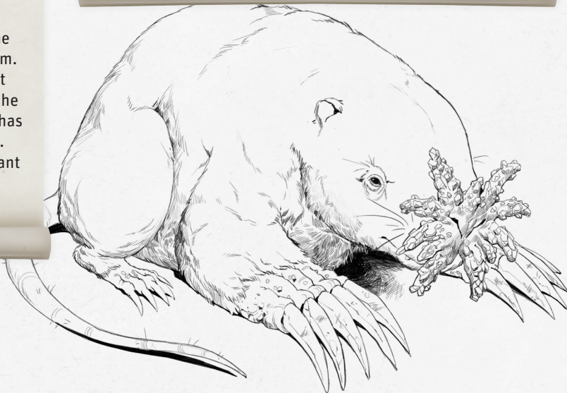
GIANT GEM-NOSED MOLE

Adamantine Claws. Melee Weapon Attack: +5 to hit, reach 5 ft., one target. Hit: 10 (2d6 + 3) slashing damage plus 4 (1d8) force damage.