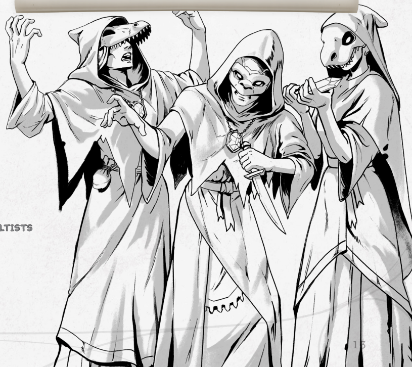
APEX PREDATOR CULTISTS

Staff. Melee Weapon Attack: +4 to hit (+7 to hit with shillelagh ), reach 5 ft., one target. Hit: 4 (1d6 + 1) bludgeoning damage, 5 (1d8 + 1) bludgeoning damage if wielded with two hands, or 8 (1d8 + 4) bludgeoning damage with shillelagh .