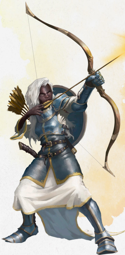
OATH OF THE WATCHTOWER